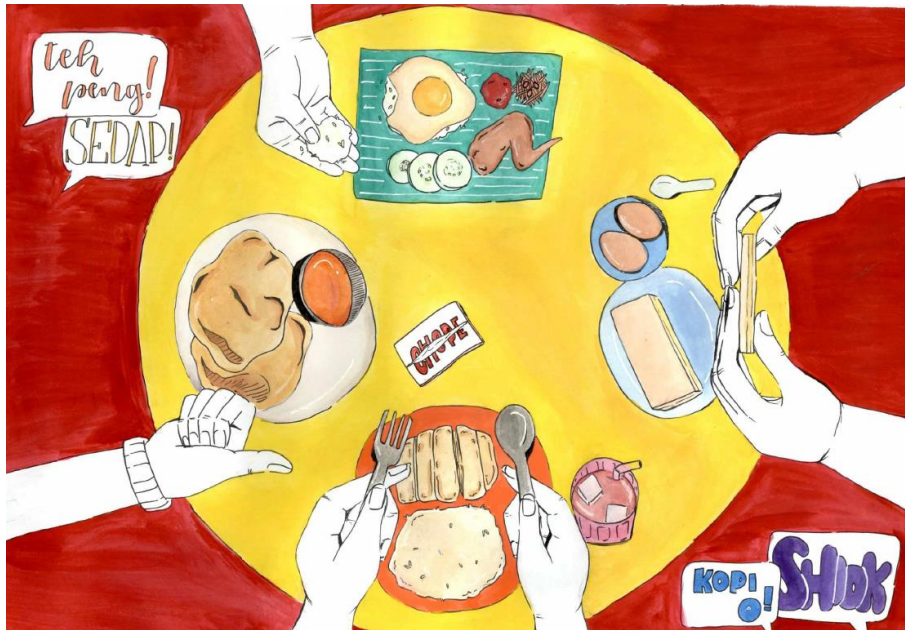
A drawing displaying the wide variety of food and common terms heard at a Hawker Centre – Riverside Secondary School