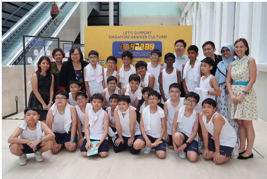
In November 2018, students from St Gabriel's Primary School dressed up as hawkers from yesteryear to engage visitors at the Our SG Hawker Culture Travelling Exhibition during its run at the National Museum of Singapore.