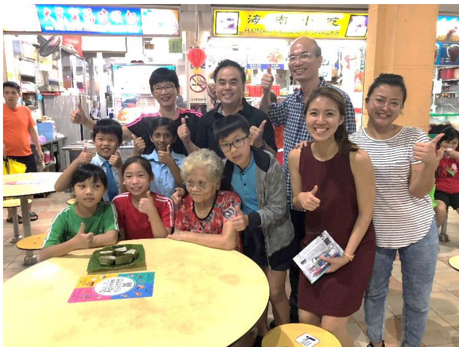
"Fond Memories of Toa Payoh" was a collaborative effort between Pei Chun Primary School and First Toa Payoh Primary School. As part of the project, students documented the lives of four residents in Toa Payoh, one of which being the first and second-generation owners of Hainan Cuisine & Snacks located at Kim Keat Palm Market & Food Centre.