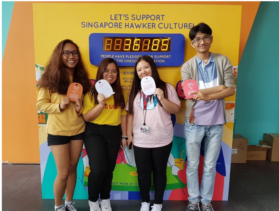
Students from Ngee Ann Polytechnic volunteering at the Our SG Hawker Culture Travelling Exhibition held at their campus in November 2018.